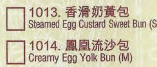
1013. 香滑奶黃包 Steamed Egg Custard Sweet Bun (S)