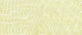
1019. 擂沙湯丸 Steamed Sesame Ball (M)