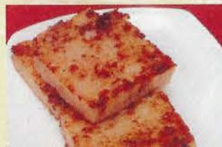
2004. 香煎蘿蔔糕 Pan Fried Turnip Cake (S)