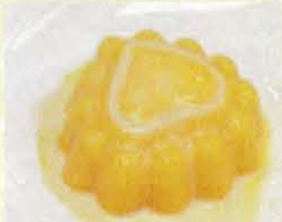
9001. 香芒滑布甸 Mango Pudding (S)