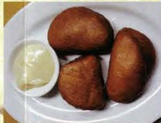
炸包 Fried Bun w/ Mayo Sauce .... 2.40