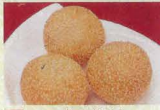
2010. 芝麻煎堆仔 Sesame Ball (S)