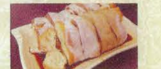
4005. 香茜腸粉 Cilantro Rice Sheet Roll (L)