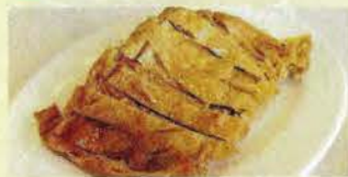
5013. 素鵝 Marinated Tofu