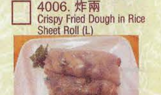
4006. 炸兩 Crispy Fried Dough in Rice Sheet Roll (L)