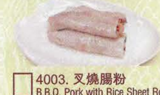
4003. 叉燒腸粉 B.B.Q. Pork with Rice Sheet Roll (L)