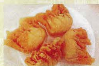
2014. 沙律明蝦角 Deep Fried Shrimp Dumpling with Salad (L)