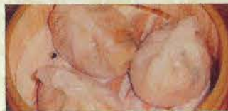
1010. 灌湯上海小籠包 Shanghai Dumpling (4pcs) (L)