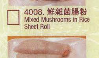
4008. 鮮雜菌腸粉 Mixed Mushrooms in Rice Sheet Roll