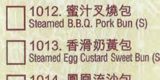
1012. 蜜汁叉燒包 Steamed B.B.Q. Pork Bun (S)