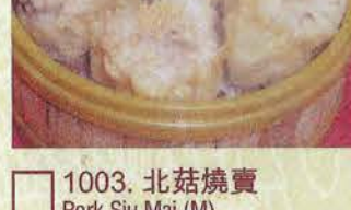
1003. 北菇燒賣 Pork Siu Mai (M)