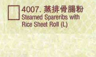
4007. 蒸排骨腸粉 Steamed Spareribs with Rice Sheet Roll (L)