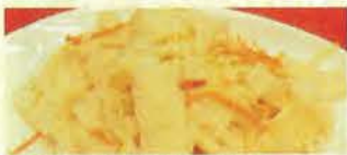
7004. 白灼牛柏葉 Boiled Beef Tripe (SP)