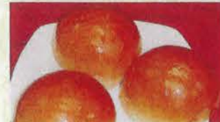
3001. 叉燒焗餐包 Baked B.B.Q. Pork Bun (M)