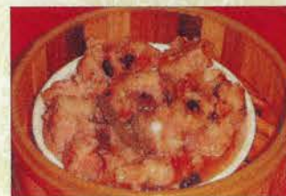
1004. 金蒜豉汁蒸排骨 Steamed Spareribs with Black Bean Sauce (M)