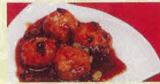
2006. 百花釀蘑菇 Shrimp Stuffed Fresh Mushroom (K)