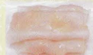
4004. 涼瓜雞絲腸粉 Chicken with Bitter Melon Rice Sheet Roll (L)