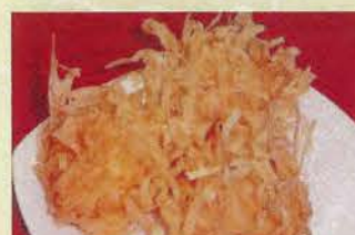
2013. 千絲炸蝦丸 Deep Fried Shrimp Balls (K)