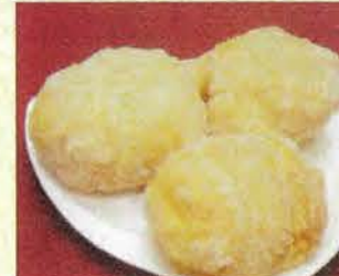
9003. 高力糖沙翁 Sweet Egg Puff (M)