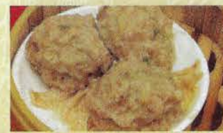
1006. 山竹牛肉丸 Steamed Beef Ball (S)