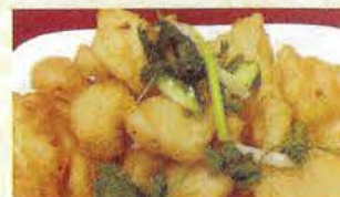
8008. 椒鹽魷魚 Salt & Pepper Calamari