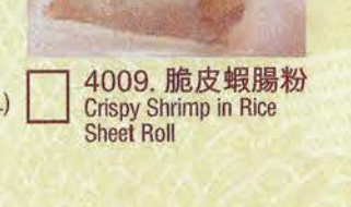
4009. 脆皮蝦腸粉 Crispy Shrimp in Rice Sheet Roll

(S) Small 小點 ~ $4.25 (M) Medium 中點 $5.25