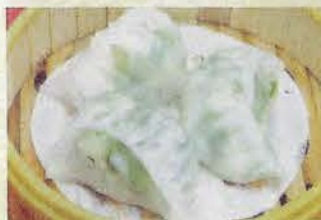
1001. 鮮蝦豆苗餃 Steamed Sweet Pea Leaf & Shrimp Dumpling (L)