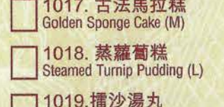
1017. 古法馬拉糕 Golden Sponge Cake (M)