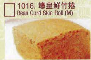
1016. 蠔皇鮮竹捲 Bean Curd Skin Roll (M)