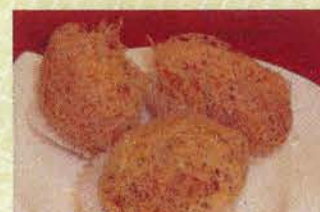
2015. 蜂巢炸芋角 Crispy Taro Turnover (M)