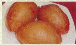
2011. 咸水角 Deep Fried Mincd Pork Dumpling (S)