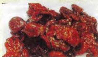
5011. 八爪魚仔 Marinated Octopus (SP)