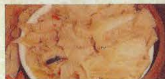
1008. 薑蔥牛柏葉 Beef Tripe with Ginger & Scallion (L)