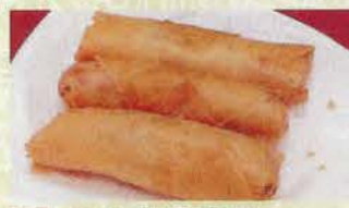
2012. 素炸春卷 Crispy Spring Roll (S)