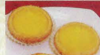
3004. 酥皮蛋撻 Flakey Egg Custard Tart (S)