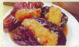
2005. 百花釀茄子 Shrimp Stuffed Eggplant (K)