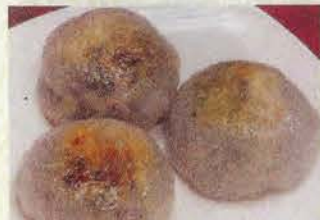
2001. 香煎韭菜果 Pan Fried Shrimp Chives Dumpling (3pcs) (L)