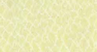
2008. 香煎蓮藕餅 Pan Fried Mincd Pork and Lotus Root Cake (M)