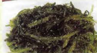
5012. 海草 Marinated Seaweed (K)