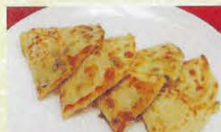
2002. 蔥油餅 Pan Fried Green Onion Pan Cake (M)