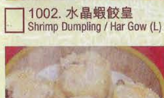
1002. 水晶蝦餃皇 Shrimp Dumpling / Har Gow (L)