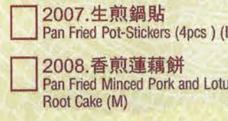
2007. 生煎鍋貼 Pan Fried Pot-Stickers (4pcs) (L)