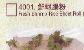
4001. 鮮蝦腸粉 Fresh Shrimp Rice Sheet Roll (L)