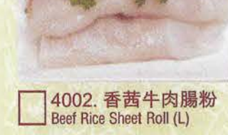
4002. 香茜牛肉腸粉 Beef Rice Sheet Roll (L)