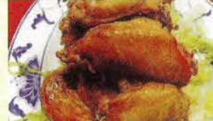
8009. 酥炸雞翼..... Deep Fried Chicken Wings (6 pcs)