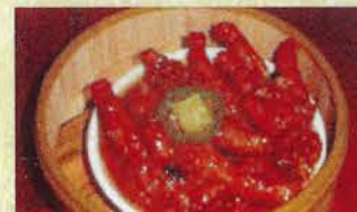
1005. 豉汁鳳爪 Chicken Feet with Black Bean Sauce (M)